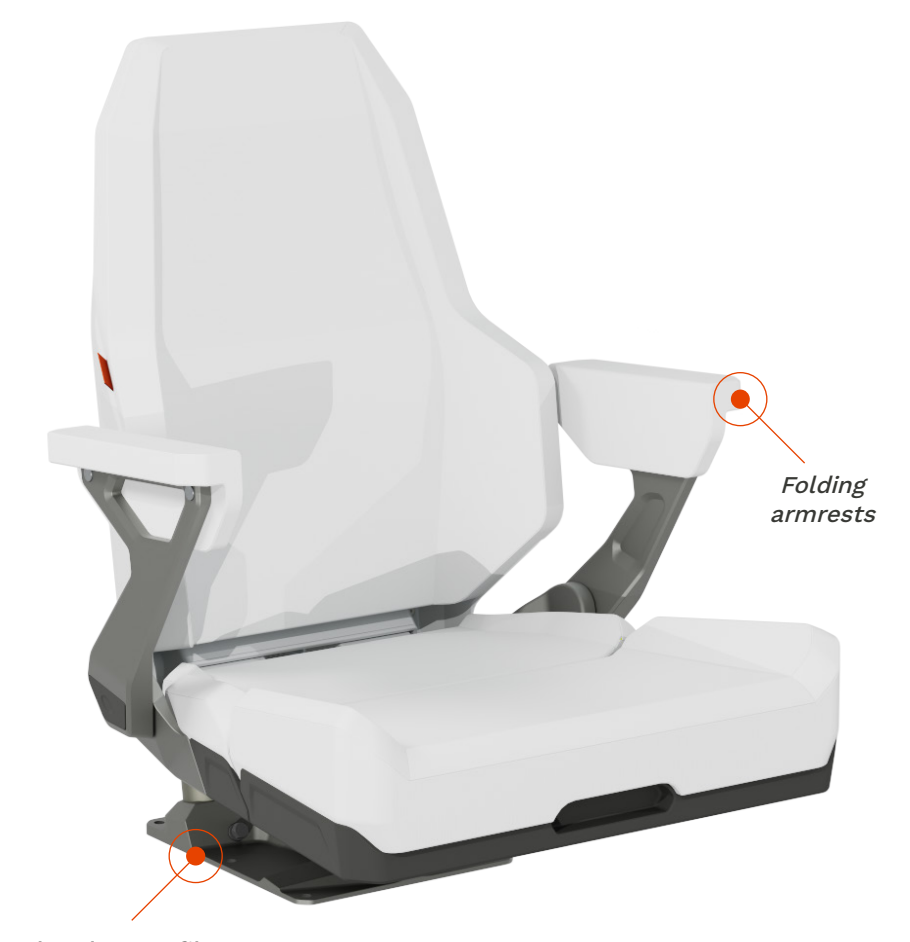
Ultra-low profile suspension base

A low profile, fixed bucket seat with a low ride height and 3.5 inches (89 mm) of suspension travel. Ideal for skiffs, bay boats, and near shore watercraft with limited space.