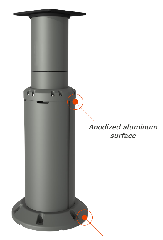
Sliding flange to mount at varying heights

Additional seat mounting adapters available.